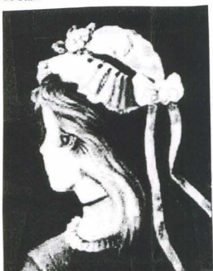
OLD WOMAN...OR YOUNG GIRL?

Hang On Sloopy is the official rock song Of Ohio.